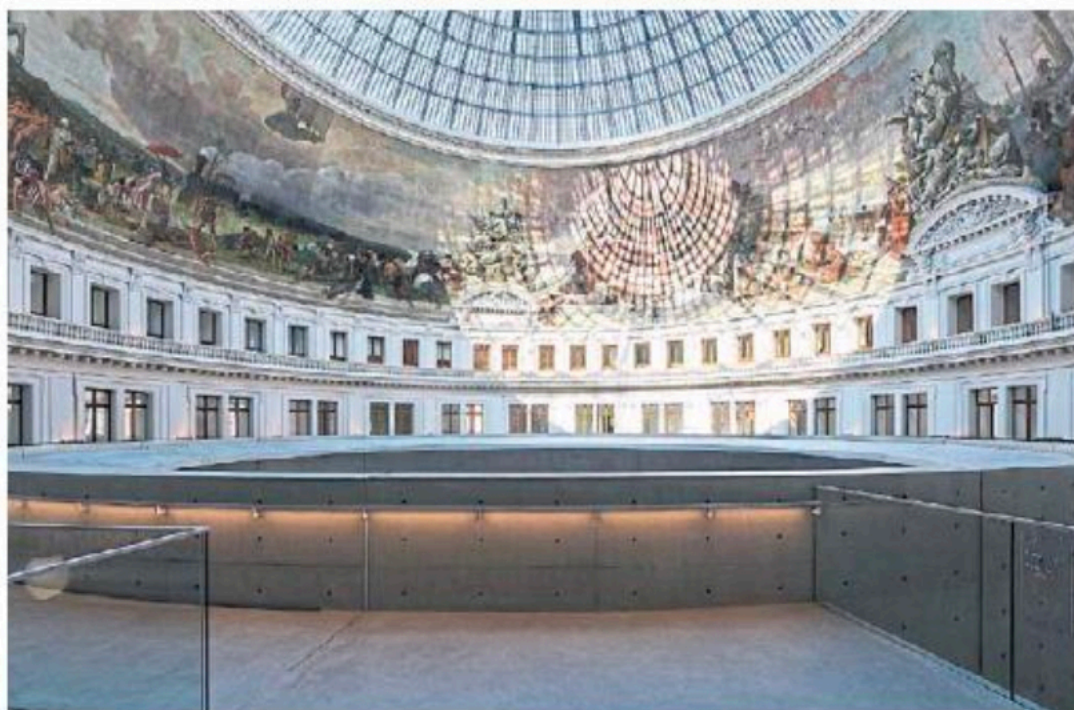
MARC DOMAGE BOURSE DE COMMERCE — PINAULT COLLECTION

The collection includes props like Dorothy's ruby slippers from "The Wizard of Oz," cameras from the 1950s and other memorabilia, but the most exciting aspect of the museum will be its programming. Temporary exhibitions and talks will address issues like the #MeToo movement and racism in historic films, and celebrate underappreciated artists such as Anna May Wong. Ahead of the opening, virtual events will kick-start the programming, including screenings and conversations with filmmakers like Spike Lee.