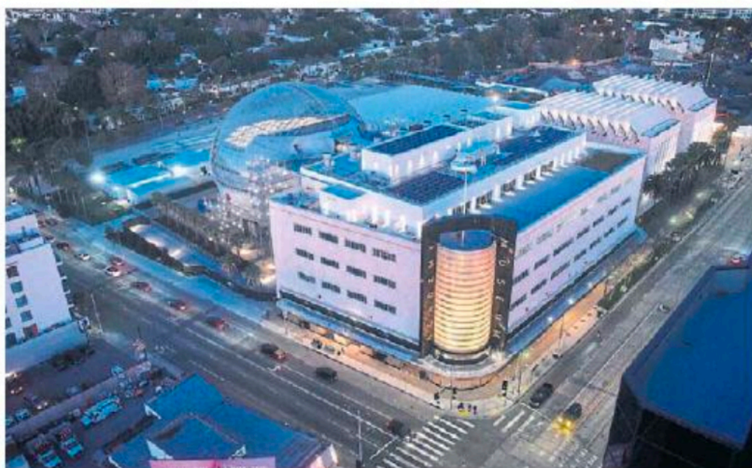
ACADEMY MUSEUM FOUNDATION

Bourse de Commerce — Pinault Collection is a museum set to open in Paris this year.